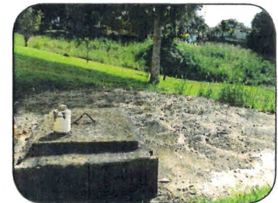
Keep septic tanks sealed.