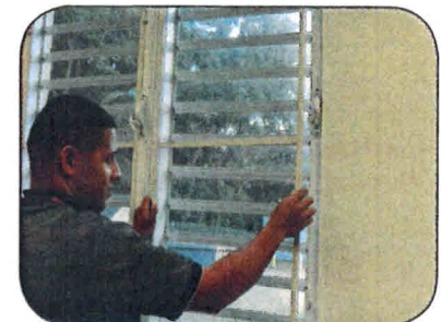
Install or repair window & door screens.

For more information, visit: www.cdc.gov/dengue , www.cdc.gov/chikungunya , www.cdc.gov/zika