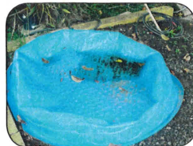
Drain water from pools when not in use.