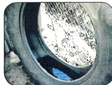
Recycle used tires or keep them protected from rain.