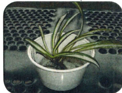
Put plants in soil, not in water.