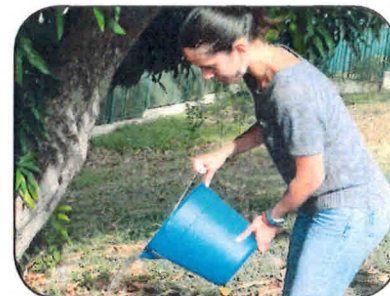
Drain & dump any standing water.