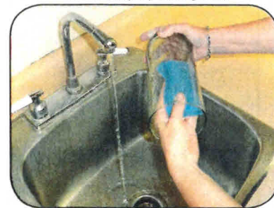
Weekly, scrub vases & containers to remove mosquito eggs.