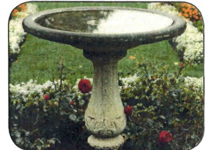
Weekly, empty standing water from fountains and bird baths.